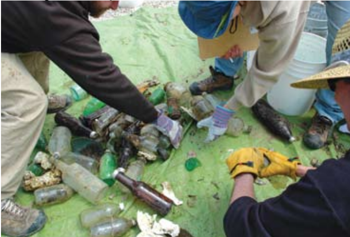
Hartsburg, MO Cleanup, 2008

Note: Volunteer workers should be encouraged to work slowly and carefully!