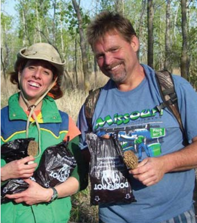
Yankton, SD Cleanup, 2009