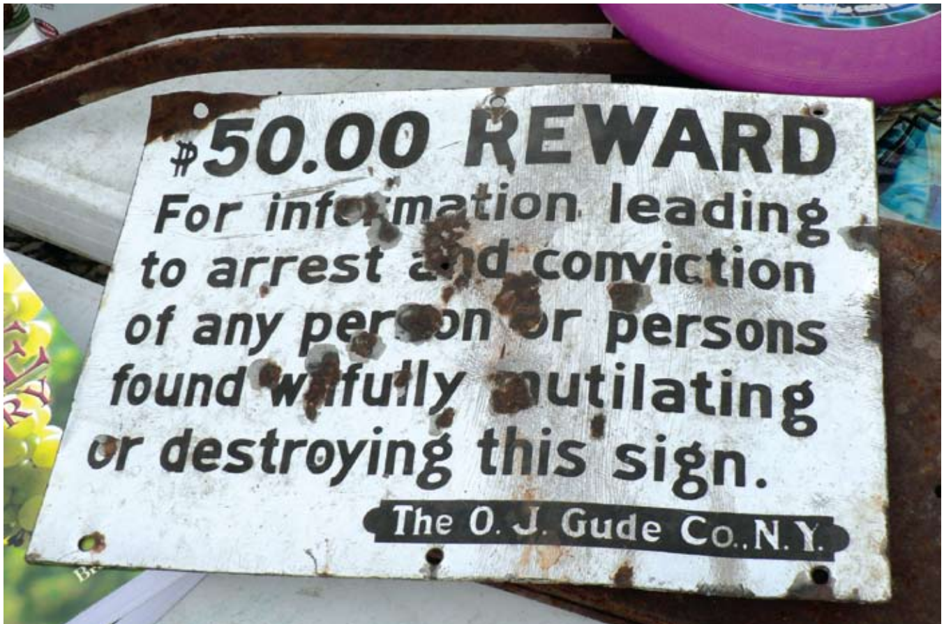
Mari-Osa Dump Cleanup, Loose Creek, MO, 2008

Sign That Really Has Something To Say... Worth it's weight in gold!