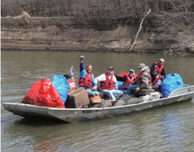
Blue River Rescue, Kansas City, MO, 2008