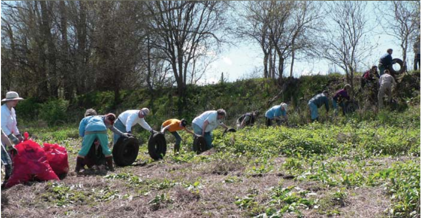
Blue River Rescue, Kansas City, MO, 2007