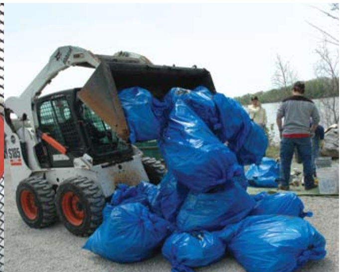
Hartsburg, MO Cleanup, 2008