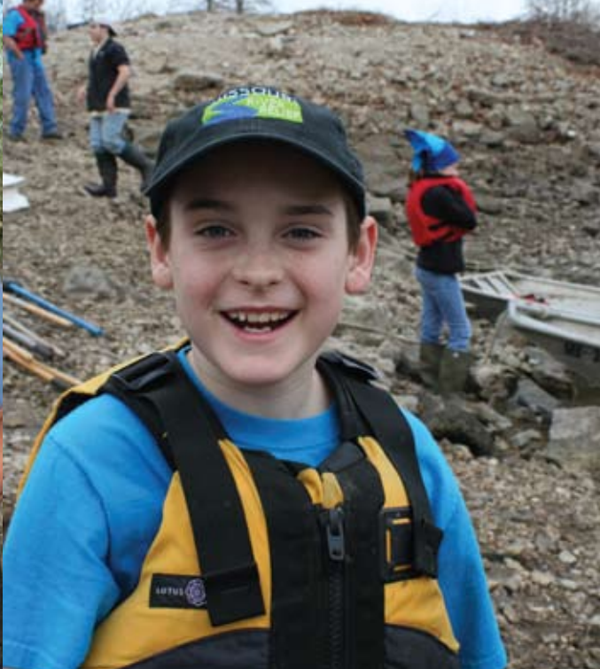
Mari-Osa Dump Cleanup, Loose Creek, MO, 2009