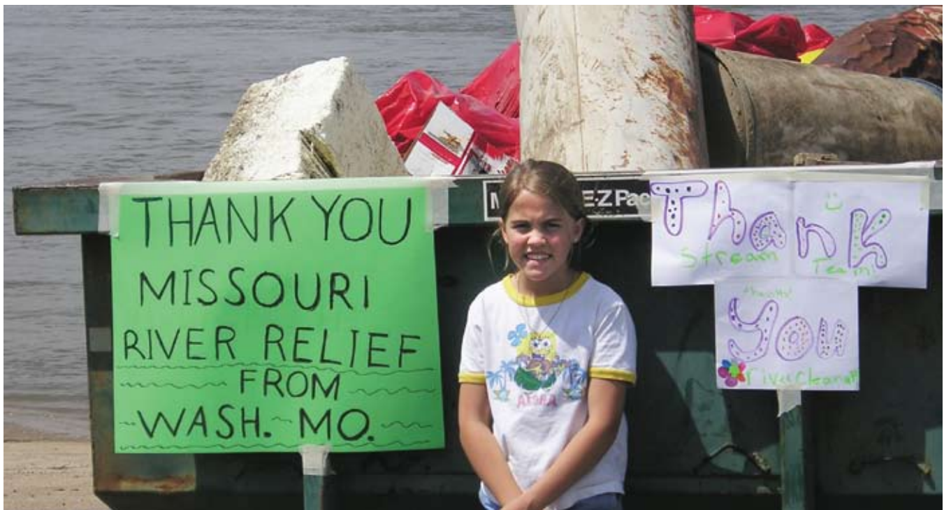
Washington, MO Cleanup, 2004