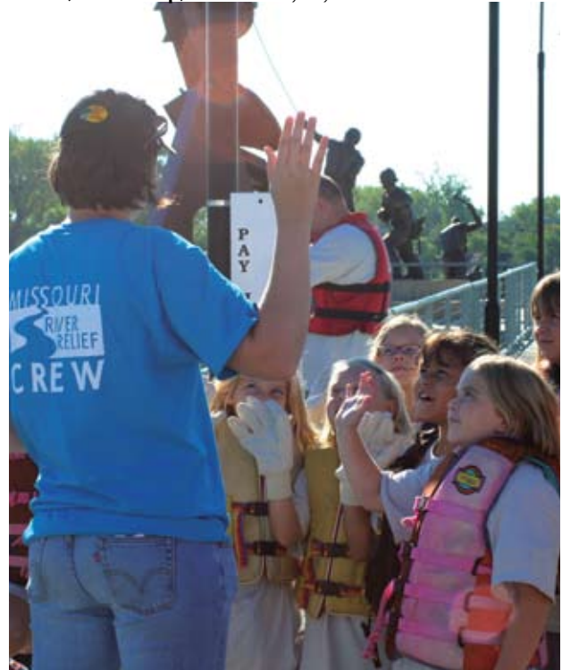
Omaha, NE Cleanup, 2007

Hint: Appoint one person with a cell phone to be group leader. Ask them to save the phone number of their boat driver for emergency purposes.