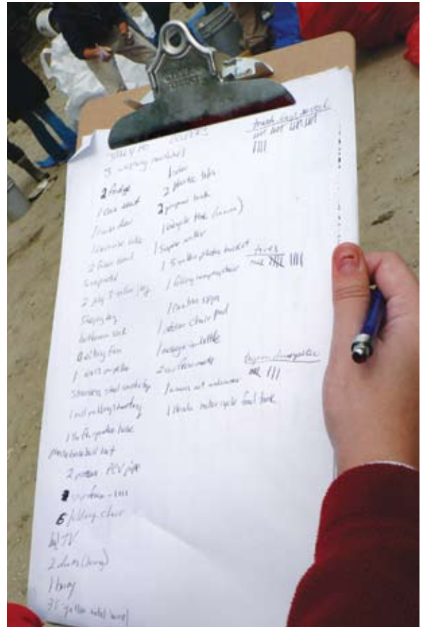
Cooper's Landing, MO, Cleanup, 2007