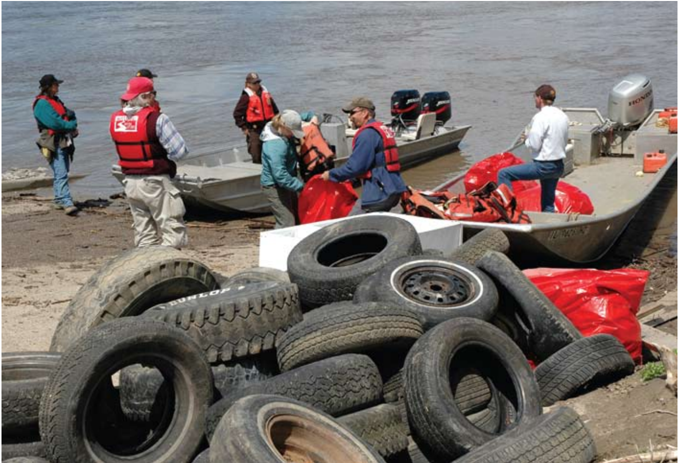
Confluence Cleanup, St. Louis MO, 2005