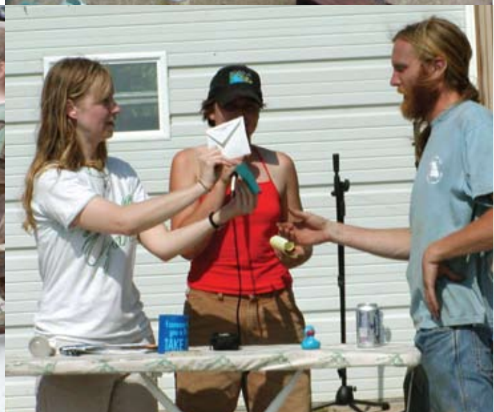
Trash Contest, Coopers Landing, MO, 2004