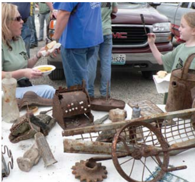
Mari-Osa Dump Cleanup, Loose Creek, MO, 2009