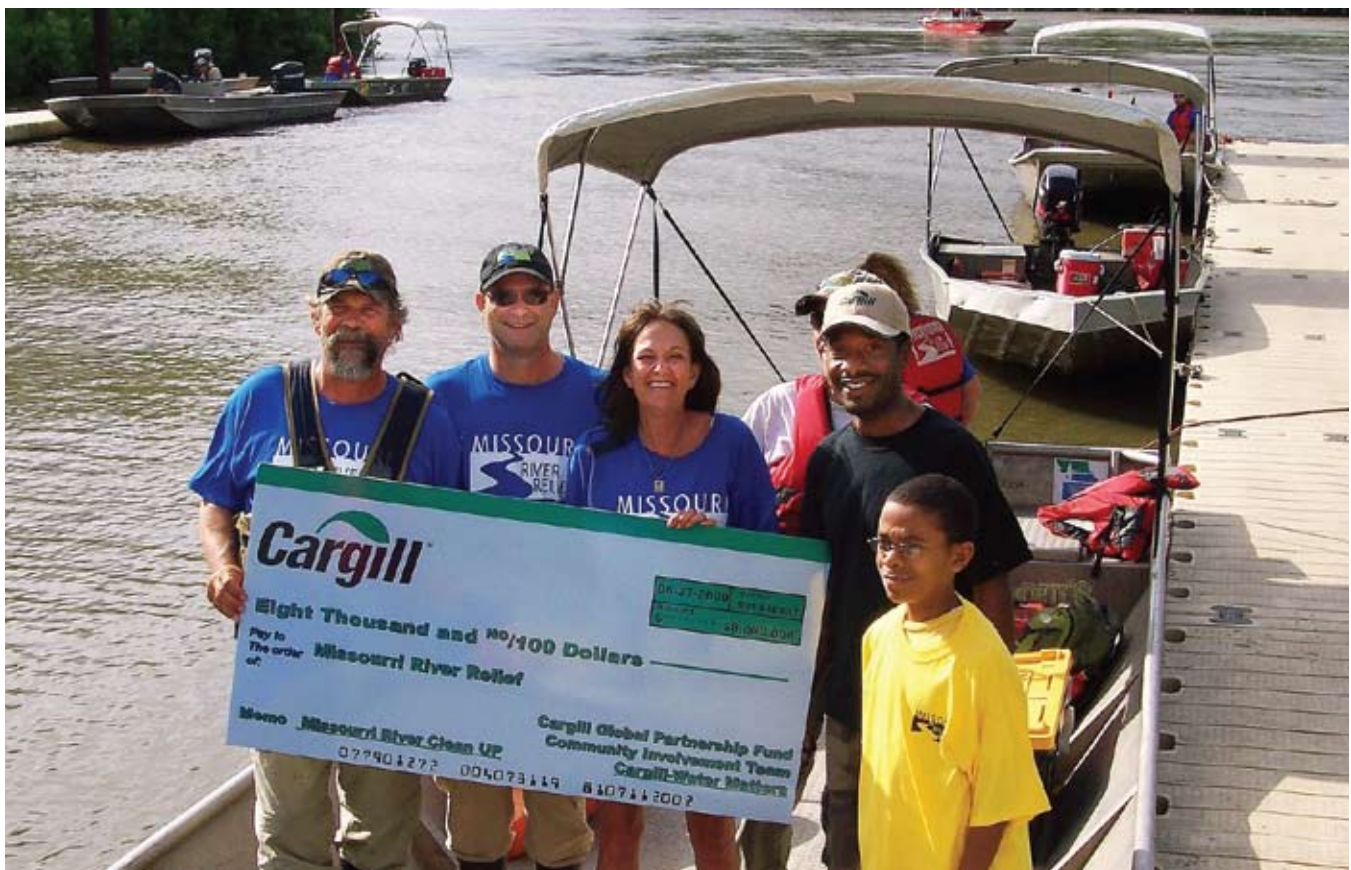
Siouxland Cleanup, Sioux City, IA, 2009

Note: Donations of time and materials are as valuable as money.