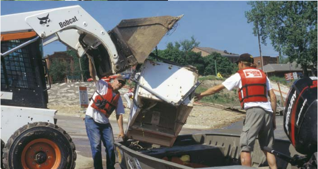
Washington, MO Cleanup, 2004

Heavy-equipment operators should shout “Secure” when the machine has stopped moving. Volunteers should repeat “Secure” to let the operator know they heard the command.