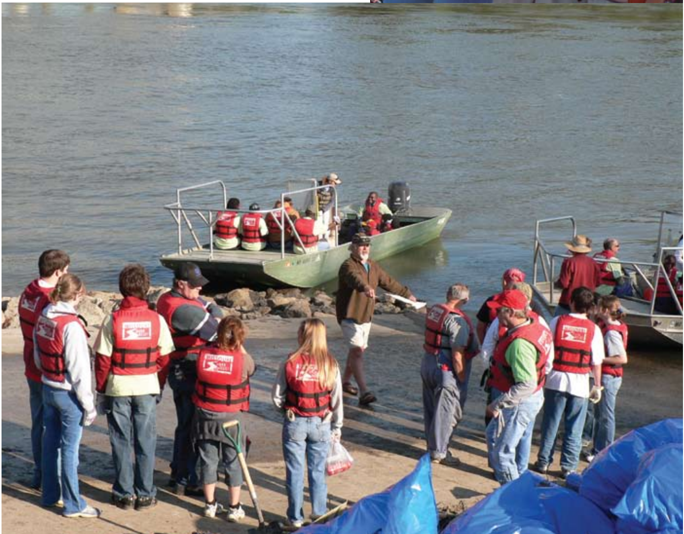
Kansas City Area Cleanup, LaBenite Park, Sugar Creek, MO