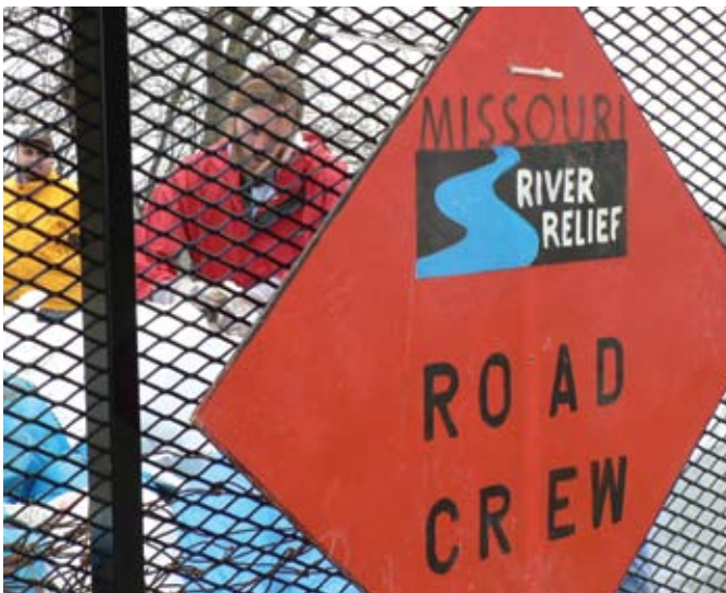
Old Plank Road Cleanup, Columbia, MO, 2007

NOTE: A land cleanup can be as small as collecting trash in the vicinity of the cleanup headquarters or picking up litter along the parking lot and nearby roads.