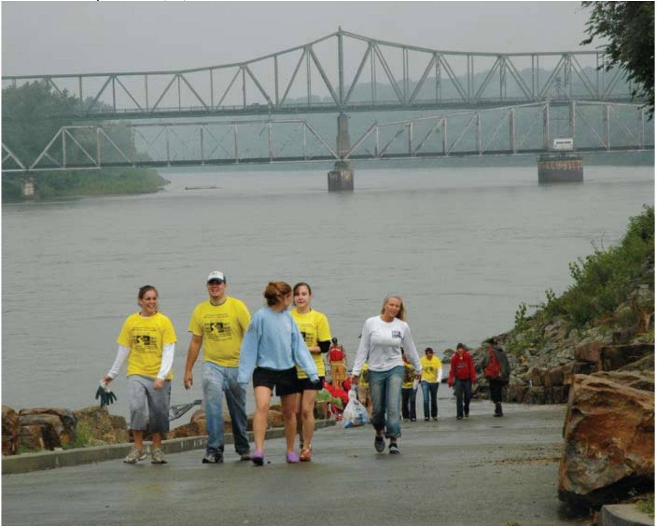
Atchison, KS Cleanup, 2006