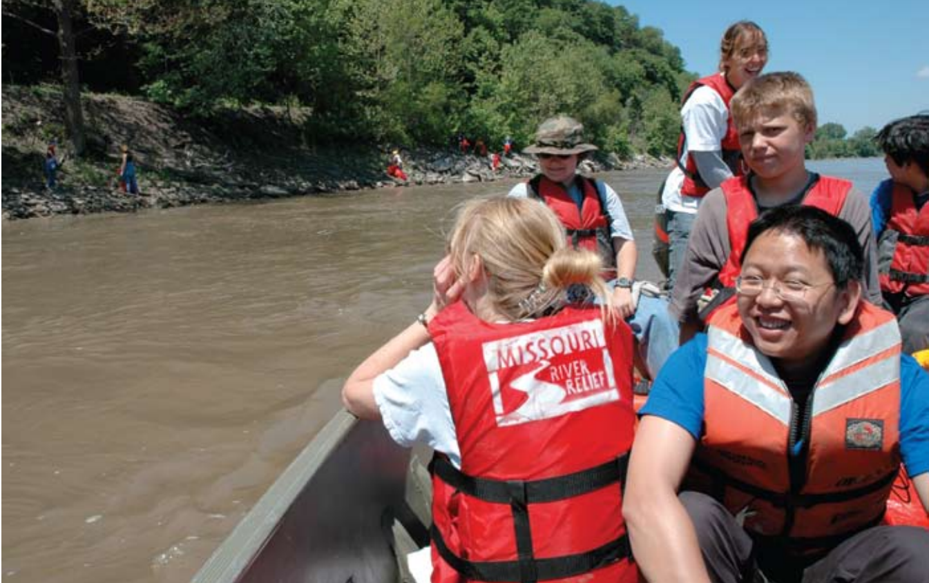
Coopers Landing, MO Cleanup, 2005