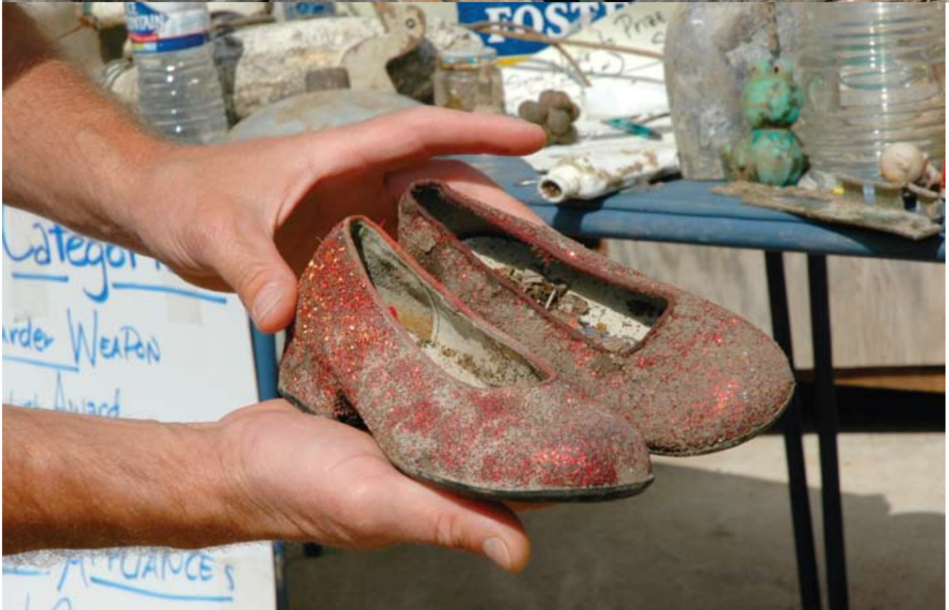
Trash Contest, Coopers Landing, MO, 2005