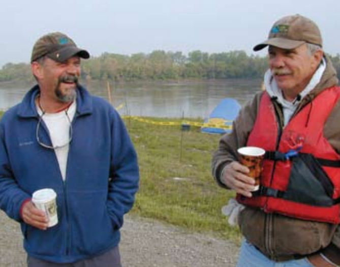
Confluence Cleanup, St. Louis, MO, 2005