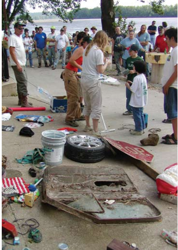
Trash Contest, Coopers Landing, MO, 2004

NOTE: A message in a bottle always deserves to win an award!