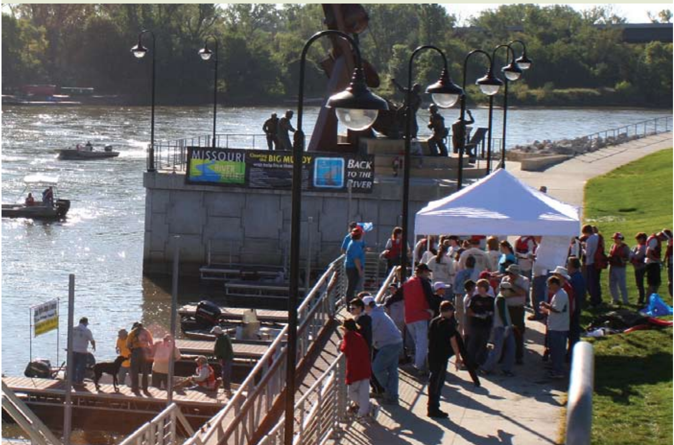
Omaha/Council Bluffs Cleanup, NE & IA, 2007

Volunteers typically return for a lunch provided by the cleanup organizers and then go home. After lunch, the people who want to keep working are designated into groups for the “trash haul.” These groups board boats to pick up the trash piled up along the river banks and haul it back to the central site for sorting and disposal.