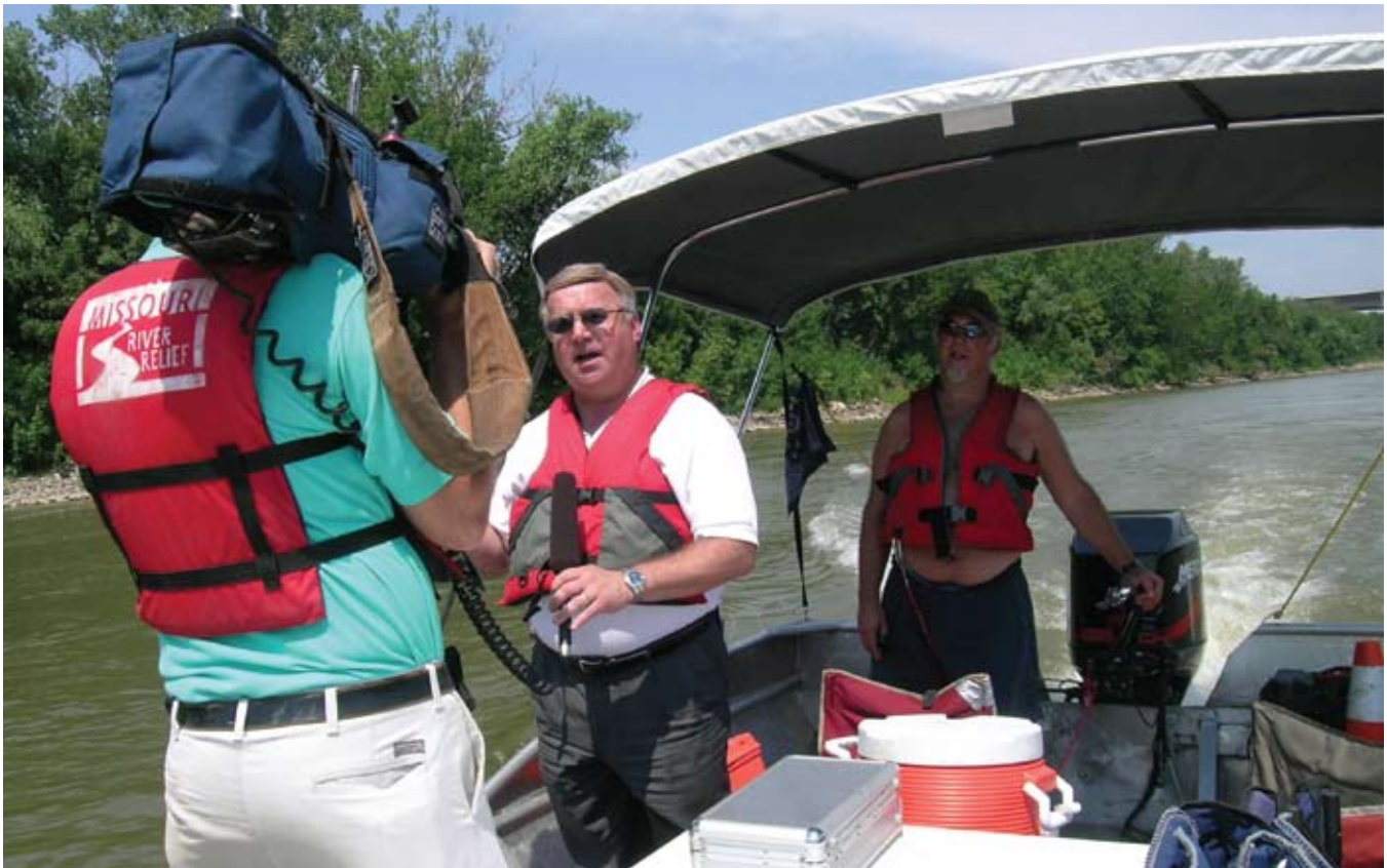
MegaScout 340-Mile Trash Survey, 2006

Hint: Follow up press releases with phone calls to media outlets. Send photos or other intriguing information.