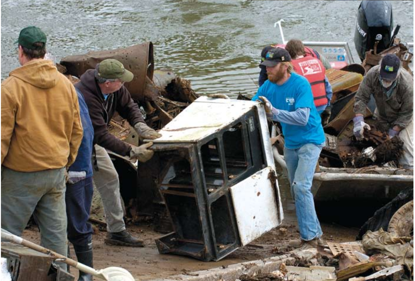
Mari-Osa Dump Cleanup, Loose Creek, MO, 2008