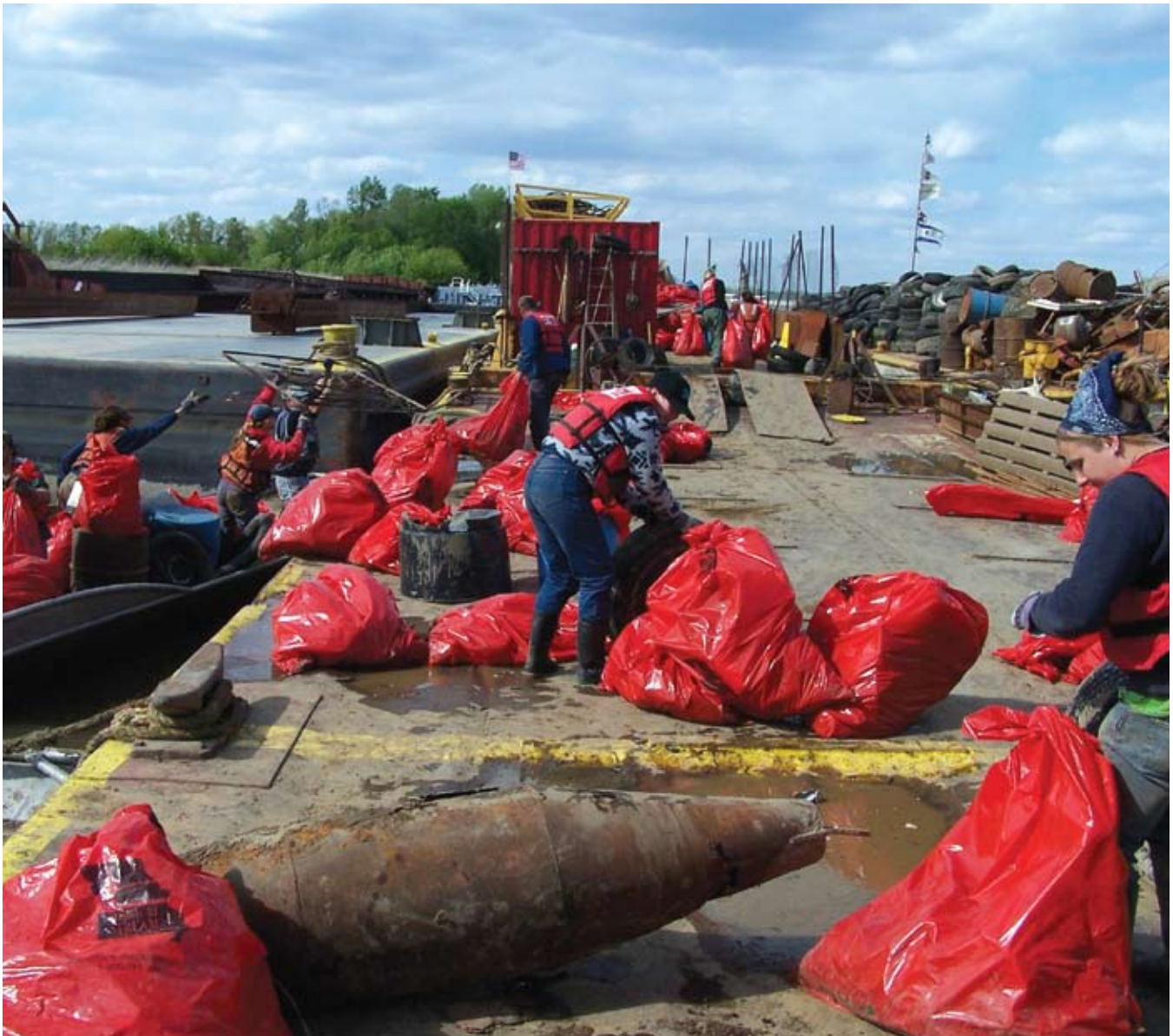
Confluence Cleanup, St. Louis, MO, 2005