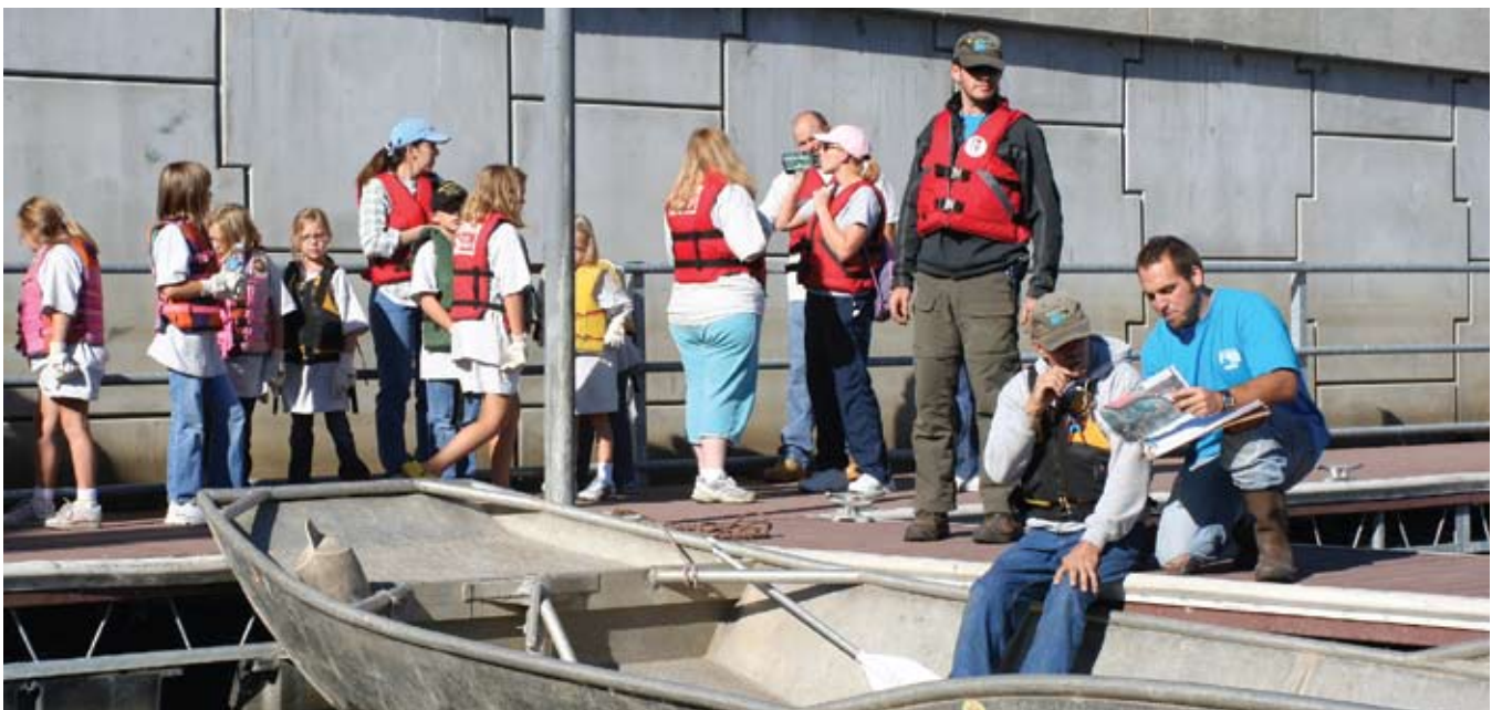
Omaha, NE Cleanup, 2007

Help make this cleanup an enjoyable and informative experience!