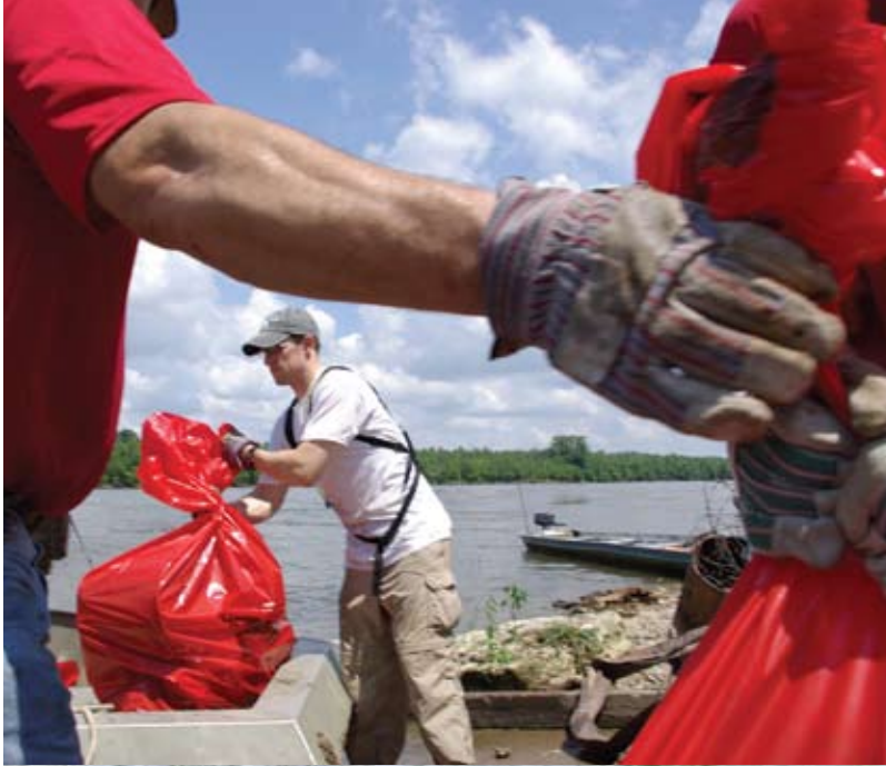
Osage River Cleanup, Bonnots Mill, MO, 2006