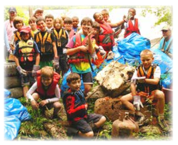
The "River Kids" on Mosenthein Island in St. Louis, MO