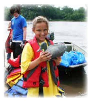
All Donations are Tax Deductible